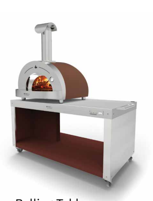
Rolling Table The optional stainless steel multi-purpose table offers additional counter and storage space for outdoor food preparation.