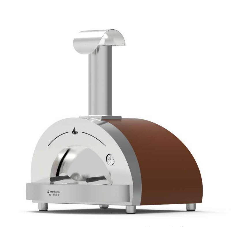
Counter Top Oven

You'll find the Patio Oven 3.2 perfect for Sunday night with the family. Roast a chicken, bake some bread, or grill some veggies and enjoy your dinner on the patio.