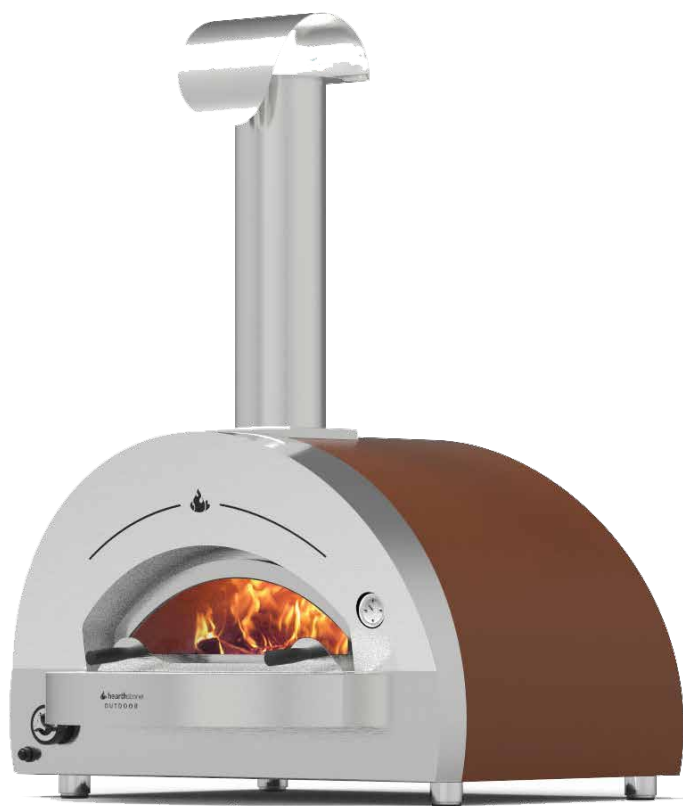
Counter Top Oven

Our largest oven heats up quickly with a powerful gas burner. Or, fire up the oven with wood to impress your foodie friends. With plenty of room for pizzas and the optional grill kit, you'll be inviting the whole team over after your next game.