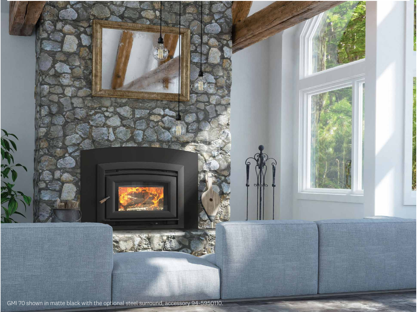
GMI 70 shown in matte black with the optional steel surround, accessory 94-5950110.