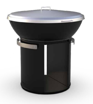
Fire pit cover The optional stainless steel cover will keep the weather out in any season.